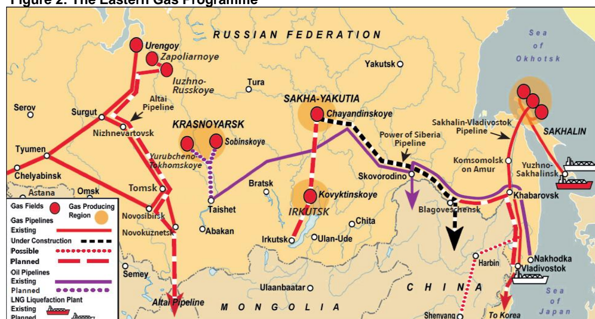
Figure 2: The Eastern Gas Programme

The UGS system covers the European part of Russia excluding eastern Siberia and the Far East regions. 24 In September 2007 the Russian government entrusted Gazprom with the responsibility to coordinate and implement the Eastern Gas Programme (EGP), 25 part of the government's wider initiative aimed at accelerated development of eastern Siberia and the Far East (Figure 2). 26