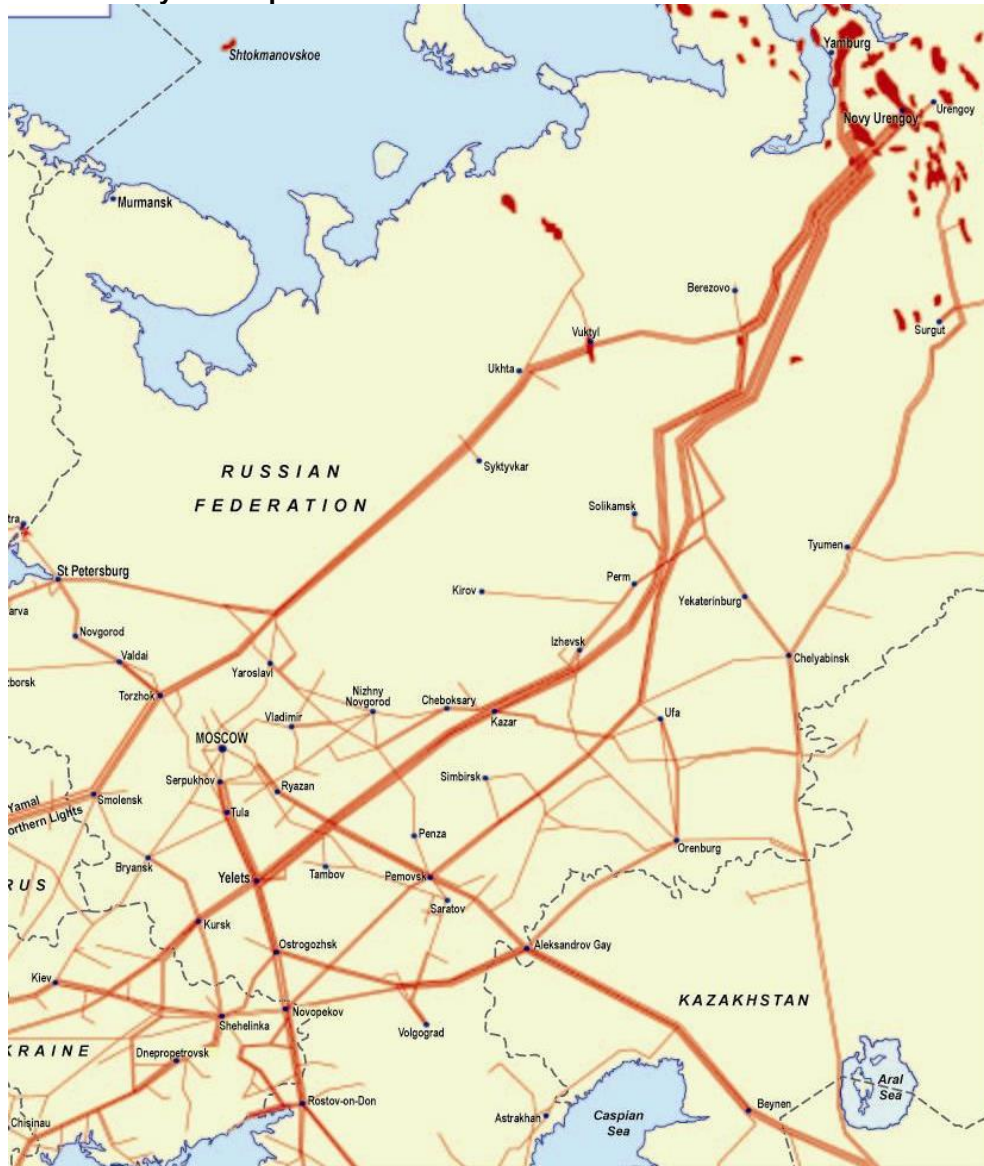
Figure 1: The UGS System Pipelines

which mandated the government to develop a new concept of Russian gas market development 14 ), legal unbundling laid down the structural foundation for a non-discriminatory access regime – the main objective of ownership unbundling. 15